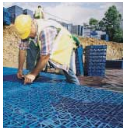
Clipping the AquaCell units together

valuable developable land, and leaves the surface above available for gardens, landscaping, driveways or car parks. With a 95% void ratio and a surface area, which is 43% perforated, AquaCell constructions can often be smaller than alternative traditional methods, resulting in a versatile, effective solution to stormwater management.