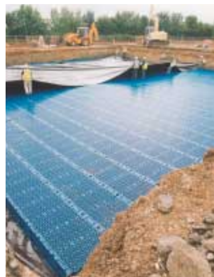
Wrapping the AquaCell structure