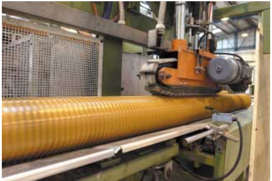
Osma UltraRib during manufacture