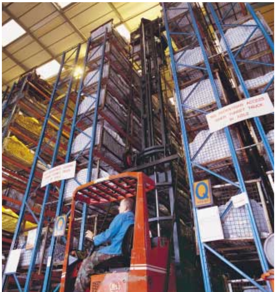
Warehouse and distribution

A computerised distribution system controls the despatch and routing of the transport fleet to calculate the most efficient load and journey plan, and deliveries are made within three to five days of the date the order was placed, either directly to site or to the merchant yard.