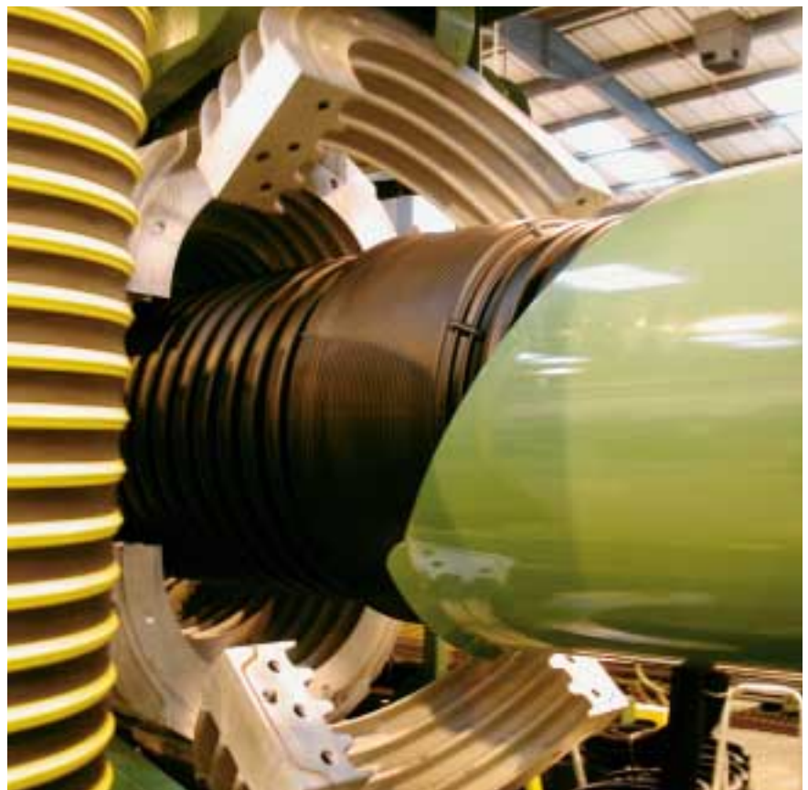
Wavin TwinWall pipe production