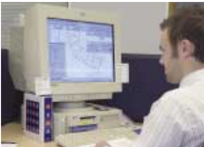
The latest CAD technology

The sales team is supported by a Technical Design Department with full CAD facilities, able to provide design and engineering drawings, schedules of components, and detailed technical advice. Data and drawings can be transferred to customers electronically, saving time and ensuring absolute accuracy.