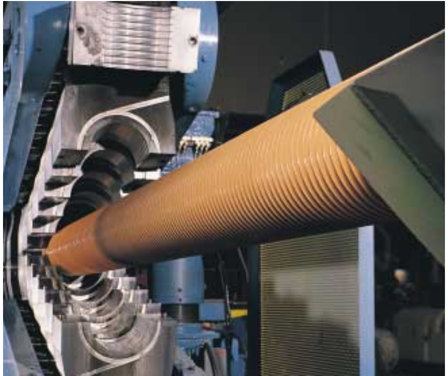
Osma UltraRib pipe production

All products carry the Wavin assurance of quality and reliability.