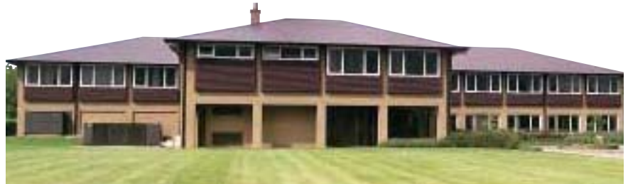
Chippenham Head Office

Order fulfilment is also taken very seriously indeed. The sales office handles over 300 orders every day. All orders are processed within 24 hours, and increasingly, orders and invoices are processed by electronic data interchange (EDI) ensuring fast, accurate communication.