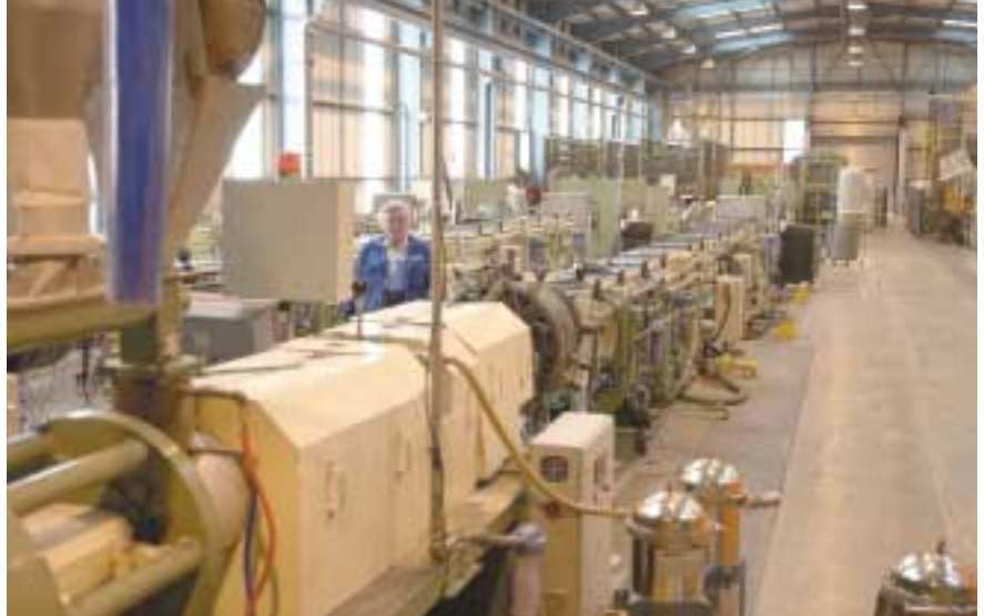
Wavin extrusion line

Wavin has now expanded its range of underground drainage and sewerage systems, and provides the industry with one of the most comprehensive packages available. The range includes