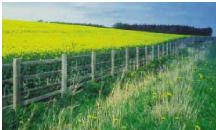
WavinCoil provides cost effective land drainage